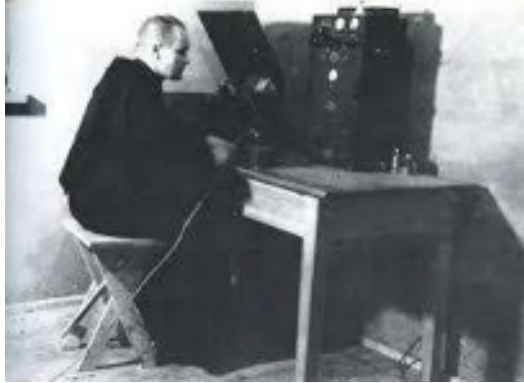
Father Maximilian Kolbe SP3RN

nine others. After two weeks without food and water, Father Kolbe died on August 14, 1941. As such, today St. Maximillian Kolbe Radio Net can be heard at 3814 kHz Sundays at 2400Z.